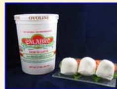
Ovoline 3.5 oz Pack Size: 2/3 lb. Code #: HCFM Shelf Life: 38 days