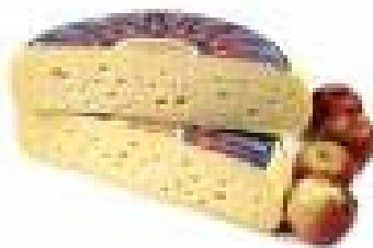
CDS Dolomite Swiss Style Cheese 17.6lb Dolomitenkönig is a , soft-textured cheese made in the Swiss style. It has a full flavor with just a dash of sweetness and a hint of walnut. A cow's milk cheese, aged 60 days. Its characteristic feature is its slightly convex shape and unmistakable holey texture.