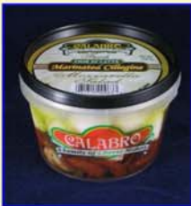
Ciligine Salad Pack Size: 6/12 oz Code #: HC964 Shelf Life: 45 days