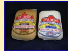
Gourmet Smoked Mozzarella / Fresh Wrap Mozzarella Pack Size: 6/ 1lb Code #: HCMS / HCFMI Shelf Life: 40 days