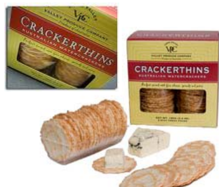
CCP Valley Produce Crackerthins 12/5.3oz $46.00/cs From Australia's most recognized and respected gourmet food companies.