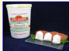
Boconcini 1.54 oz Pack Size: 2/3 lb. Code #: HCFMB Shelf Life: 38 days