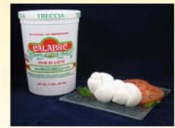
Trecia 8 oz Pack Size: 2/3 lb. Code #: HC170 Shelf Life: 38 days