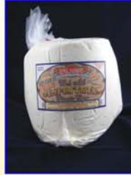
Whole Milk Impastata Pack Size: 1/ 30 lb Code #: HCl30 Shelf Life: 36 days