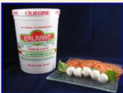
Ciligine .33 oz Pack Size: 2/3 lb. Code #: HCFMC Shelf Life: 38 days