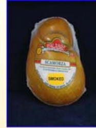
Split Smoked Scamorza Pack Size: 6/.5 lb Code #: HC1130 Shelf Life: 180 days