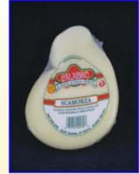
Split Scamorza Pack Size: 12/.75 lb Code #: HCSCAS Shelf Life: 180 days