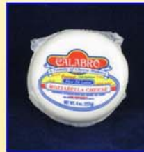
Fresh Wrap Mozzarella Pack Size: 8 / 8 oz Code #: HC964 Shelf Life: 40 days