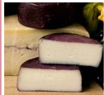
CFCR Formai Ciok Al Vino Rosso 15lb A cow's milk cheese of semi-hard consistency, uniformly textured or eyed to a limited degree, steeped in grape must for 10 days. Grape residues cling to the characteristically dark rind.