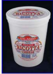
Hand Dipped Ricotta Pack Size: 2/11 lb and 2/5.5 lb Code #: HCR and HC328 Shelf Life: 28 days