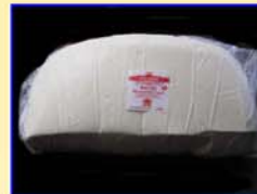
Mozzarella Curd Pack Size: 2/21.5 lb Code #: HMMC Shelf Life: 21 days