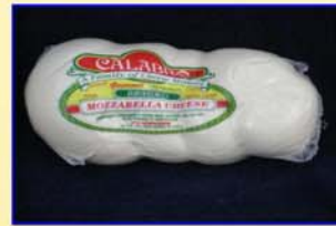
Fresh Wrap Gourmet Braids Pack Size: 6/1lb Code #: HC185 Shelf Life: 36 days