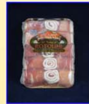
Rotolini Gold Pack Size: 8/8 oz Code #: HC379 Shelf Life: 50 days