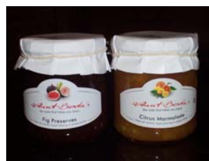
Aunt Berta's Preserves 8/8.8oz ABPF Fig Preserves ABCM Citrus Marmalade All natural Jams from Israel.