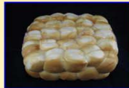
Smoked Boconcini Pack Size: 1/5 lb Code #: HC353 Shelf Life: 65 days