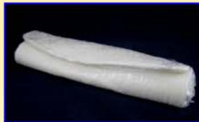
Mozzarella Sheet Pack Size: 2/2 lb Code #: HC370 Shelf Life: 28 days