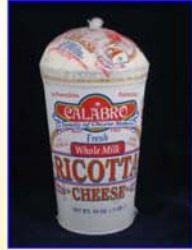
Hand Dipped Ricotta Pack Size: 4/3 lb and 8/1.5 lb Code #: HCRT3 and HCRT Shelf Life: 28 days