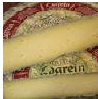
CLG LaGrein Wine aged Cheese 4.5lb $11.99/lb Aged in the must of La-grein grapes