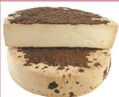
CCU Ubriaco Capra al Traminer 12.5lb $15.99/lb Goat's milk cheese aged in the must of Traminer wine grapes Veneto